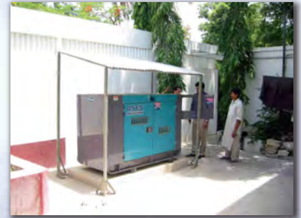
As the Emergency power source in the hospital.