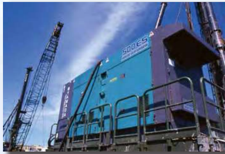
As the power source in the construction site.