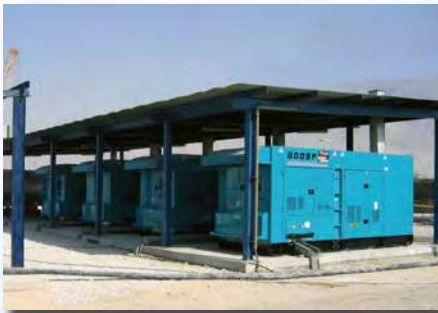
As the power source in the area where electricity is unavailable.